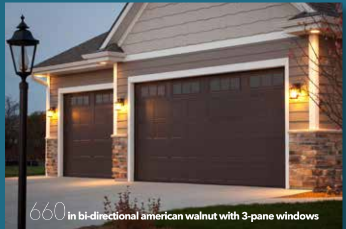
660 in bi-directional american walnut with 3-pane windows