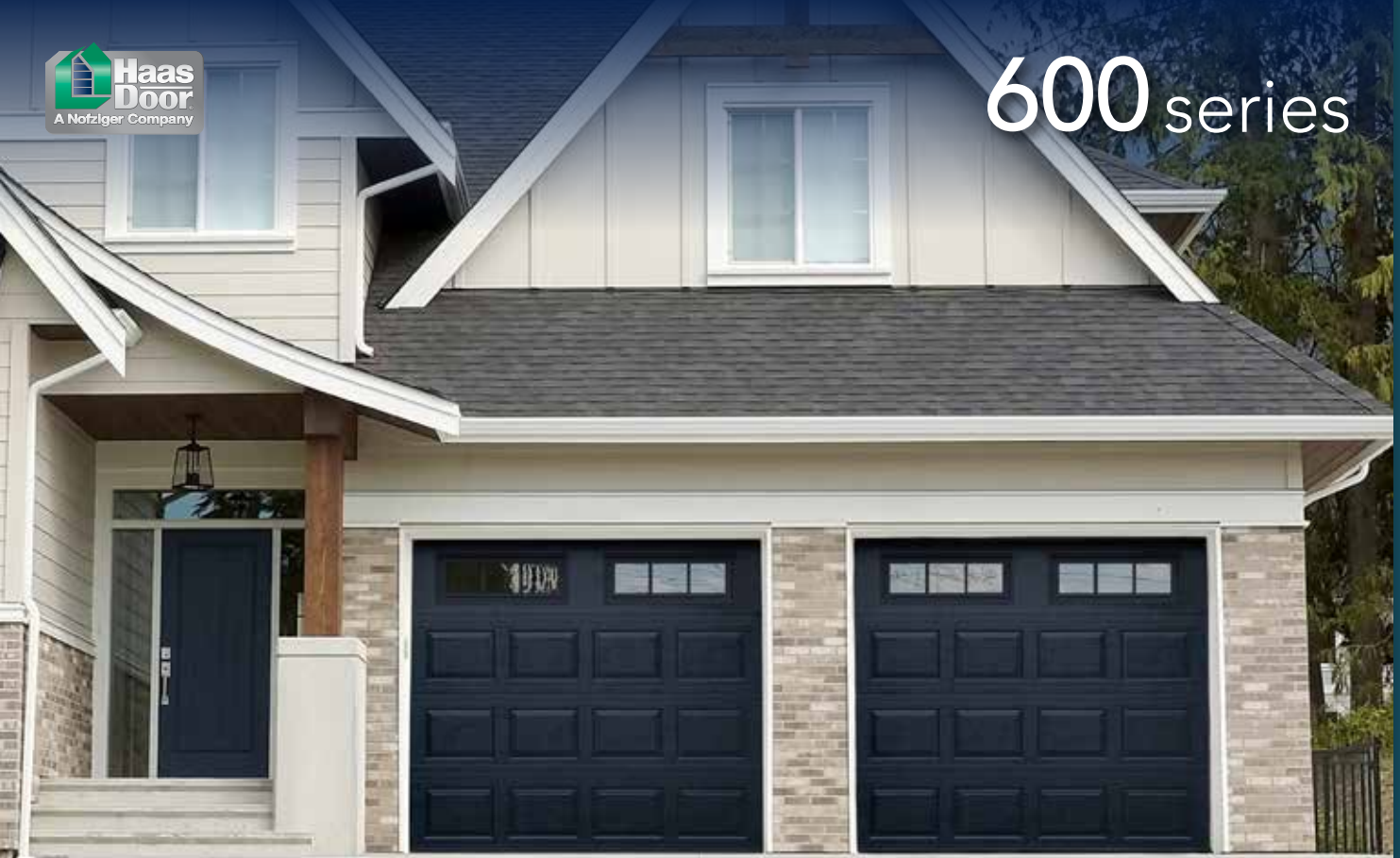
668 in carbon black with 3-pane windows