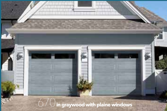
670 in graywood with plaine windows